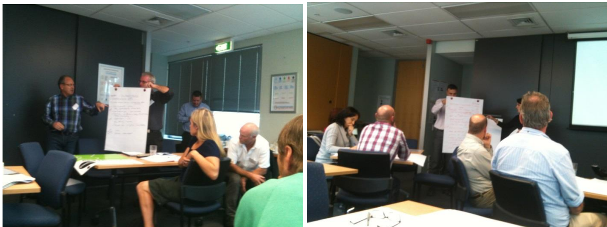
Figure 1 Workshop participants reporting back to plenary